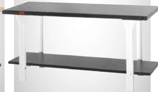
STEEL TOP WORK BENCHES

Very robust all steel worktop with four "Z" shaped crossbeams, maximum load up to 2000 kg. Rectangular holes on the beams allow to fix drawers in different positions. Rectangular holes on worktop sides to fix tool board or cabinet brackets or to adjoin other benches.