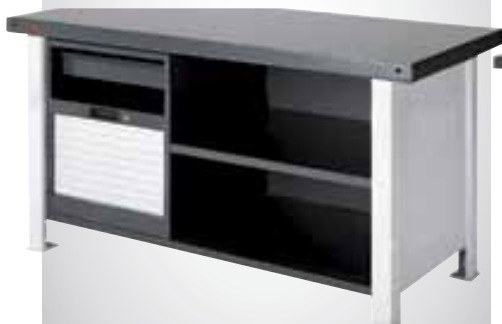
HEAVY DUTY WORK BENCH

Very robust all steel construction and epoxy coated finish. Includes one module with lockable shutter with one drawer, divided in 16 compartments, and one additional module with one shelf with large load capacity.