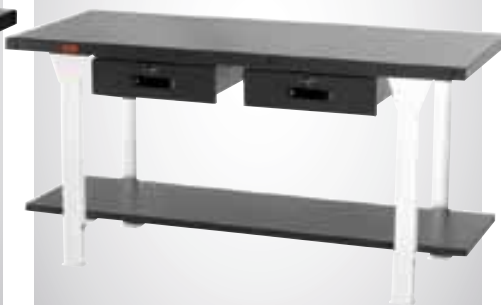
STEEL TOP WORK BENCHES WITH TWO DRAWERS

Steel top workbenches with two lockable drawers.