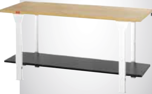
WOODEN TOP WORK BENCH