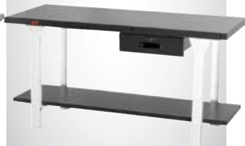
STEEL TOP WORK BENCHES WITH ONE DRAWER

Steel top workbenches with one lockable drawer.